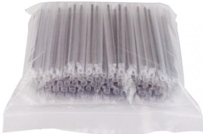
Fiber Optic Heat-Shrinkable Sleeve