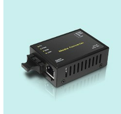
MINI 10/100/1000M SC Media Converter

Extend network distances up to 160km Support 10/100/1000/2500/10000 Ethernet Rate Conversion SC, LC and ST fiber connector options SX, FX, LX, EX, ZX, BX fiber support Multimode and single mode fiber 10BaseT, Fast Ethernet Gigabit and 10G to fiber Advanced Features : Link Pass-Through, Far-End Fault, Auto-MDIX, Fiber Fault Alert, Loopback Manage via SNMP, CLI- Telnet/SSH, Internet Browser PoE Media Converters provide PoE PSE power injection over UTP Ethernet SFP Media Converters with pluggable fiber optic ports for use with MSA compliant SFPs. Managed Media Converters with extensive security and network integration features Industrial Temperature Media Converters for equipment in -40C to +75C operating temperatures