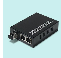
POE 10/100/1000M 2 RJ45 Port Media Converter