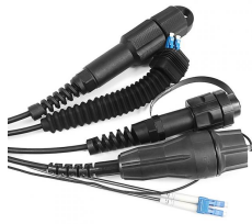
FTTX Cable Assembly