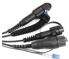
FTTX Cable Assembly