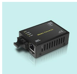
MINI 10/100/1000M SC Media Converter