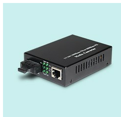
10/100/1000M Media Converter