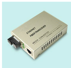
DYS1100SS Serial Media Converter