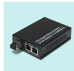
POE 10/100/1000M 2 RJ45 Port Media Converter