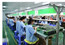
Fast connector workshop