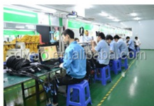
Outdoor cable assembly workshop