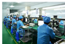
PLC splitter workshop