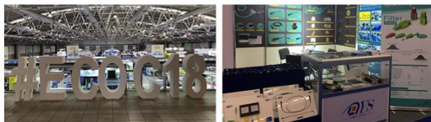
ECOC 2018 BOOTH#: 339 DATE: 24-26 SEPTEMBER ADDS: ROME, ITALY