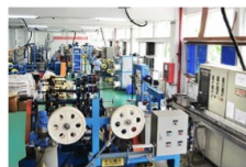
Fiber optic patch cord workshop

All of our optical products are RoHS compliant and DYS also obtained ISO9001, ISO14001 certification. Our high quality products and outstanding service win the customer from all the world, DYS fiber optic is looking forward to cooperate with you.