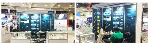
OFC 2018 BOOTH#: 5238 DATE: 13-15 MARCH ADDS: SAN DIEGO, USA