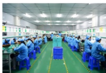
MPO MTP assembly workshop