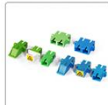
Fiber Optic Adapter