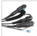
FTTX Cable Assembly