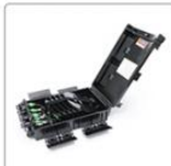
(FTTH) Terminal Box