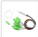
(FTTH) PLC Splitter