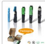
(FTTH) Fast Connector