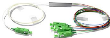
mini type PLC splitter