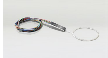
1x16 mini type PLC splitter without connector