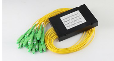
1x16 ABS PLC splitter with SC APC connector