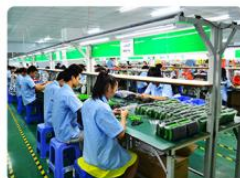
Fast Connector Workshop