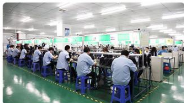
FTTA Cable Assembly Workshop