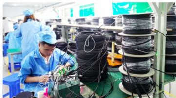
FTTH Cable Assembly Workshop