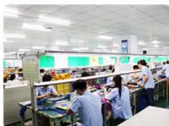
Patch Cord Workshop