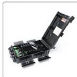
(FTTH) Terminal Box