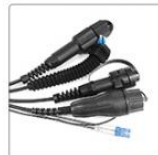
FTTX Cable Assembly