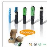
(FTTH) Fast Connector