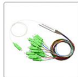
(FTTH) PLC Splitter