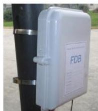
FTTH-005 fiber termination box on the pole