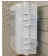
FTTH-005 fiber termination box on the wall