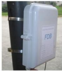
FTTH-005 fiber termination box on the pole