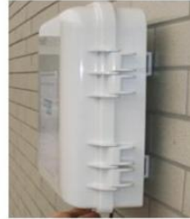
FTTH-005 fiber termination box on the wall