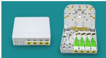
FTTH - 019 / 4Core 100mm(W)x83mm(H)x32mm(D)