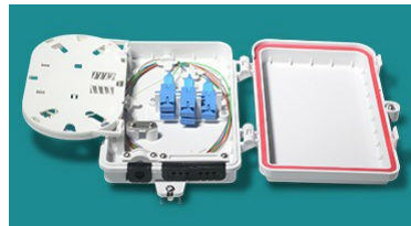
FTTH - 015 / 6Core 210mm(W)x140mm(H)x40mm(D)