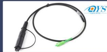
H optic with round drop cable