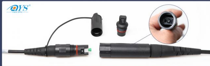
Female H Optic (SC/APC) Connector Waterproof Fiber Optic Patch Cord