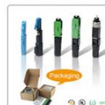
(FTTH) Fast Connector