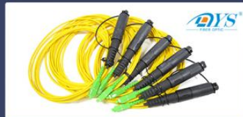
H optic with indoor cable