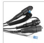
FTTX Cable Assembly