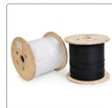
Fiber Optic Cable