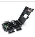
(FTTH) Terminal Box