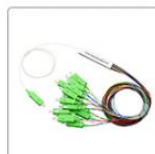
(FTTH) PLC Splitter