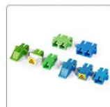
Fiber Optic Adapter